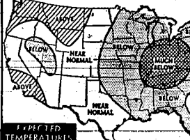
Temperatures during February will average below seasonal normals over the eastern half of the U. S. with greatest departures in the Ohio valley. Northwest will have above normal temperature.