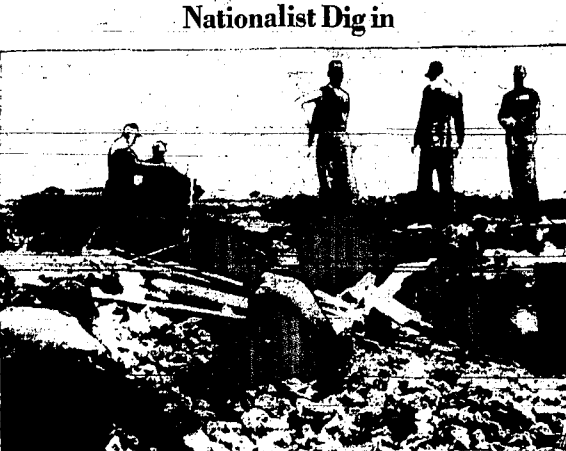
Chinese Nationalist soldiers are shown building bunkers on Quomoq Island within sight and gun range of the communist mainland. The defenders of this bleak island call Quomoq "a dagger in the communist's belt." They say as long as they hold Quomoq and Matsui, the sister offshore island to the north, the Formosa straits will remain "our lake."