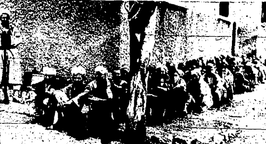
Suspects are lined up in a seated position against a wall in Khouristan, French Morocco...