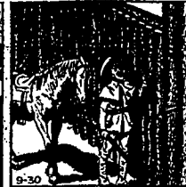
On the sixth day, Don't Boone's old friend, Simon Kenton, pointed out the site: "The savages have gone!" he cried.