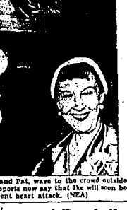
General Eisenhower, Richard Nixon and their wives, Mamie, right, and Pat, were to the crowd outside a Chicago hotel following their nomination to head the GOP ticket. Reports now say that he will soon be enough to resume some of the duties of his office following a recent heart attack.

Day of Victory General Eisenhower, Richard Nixon and their wives, Mamie, right, and Pat, were to the crowd outside a Chicago hotel following their nomination to head the GOP ticket. Reports now say that he will soon be enough to resume some of the duties of his office following a recent heart attack.