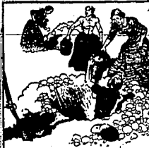
The Kenabuckians met the strategy of their foe by countermarching the tunneling of the redskins under the stockade.