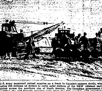
U.S. Army personnel unload supplies on a beach in Canada's eastern Arctic...