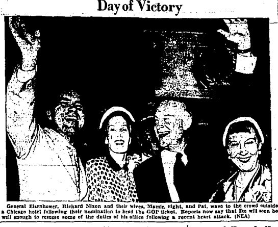
General Eisenhower, Richard Nixon and their wives, Mamie, right, and Pat, were to the crowd outside a Chicago hotel following their nomination to head the GOP ticket. Reports now say that he will soon be enough to resume some of the duties of his office following a recent heart attack.

Ed Woman of Many China Threats WATER, Calif., Sept. 30 —A missionary recently returned from the Chinese Communist area in the north and south of the Red River, said she had seen more than 400,000 Chinese in the past few years who had been threatened with death if they refused to make her confessions to the Red. Her mission was uncompleted in March, 1951, while she was in the Red River area. She was taken to a prison in the north and there she was kept for several months. She said she had seen many of the prisoners who had been taken to the prison. She said she had seen many of the prisoners who had been taken to the prison. She said she had seen many of the prisoners who had been taken to the prison.