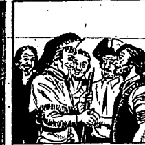
Reinforcements were near. Boone's gathering of 30 men had fought off nearly 500 redskins and Tories.