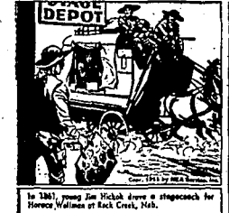
In 1867, young Jim Hickok drove a stagecoach for Steven, Wallace or Jack Creek, Neb.