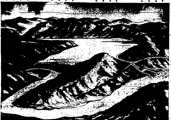
Idaho Power company's Osbow project on Snake river is shown in artist's drawing. The half-pipe turn of the river from the dam to the high, backing its reservoir waters to the tailrace of the Brownlee dam being constructed almost simultaneously 12 miles upstream. The third power house is nearly three miles in length. The dam will be 200 feet high, backing its reservoir waters to the tailrace of the Brownlee dam being constructed almost simultaneously 12 miles upstream.