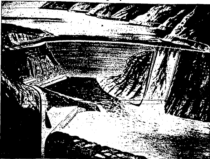
Artist's sketch of the Brownlee dam and powerhouse on the Snake river to be constructed by Idaho Power company. Nearly 400 feet high, the dam will provide a 57-mile reservoir to impound 1,500,000 acre feet of water. The first four generators will turn out 360,000 kilowatts.