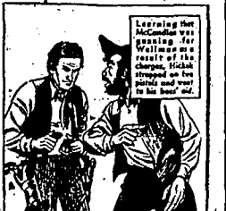
Learning that something was happening, he was well prepared for the charges, which he met as he should and went to his home.