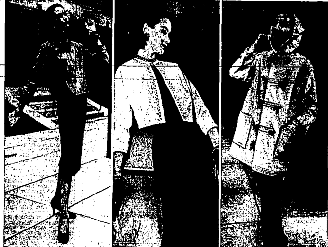
Leather that launders readily in soap-and-water provides a whole new fashion outlook for a wardrobe. New leather pullover shirt, left, is in times-thin camel-tint suede. It washes by hand or in a machine. Its lined daccron, can be worn outside or tucked into a skirt. Late day jacket, center, is in torrons pink. It's trimmed with brilliant, washable, ready. Tagger coat, right, is white washable leather lined with white fleece. The collar converts into hood.