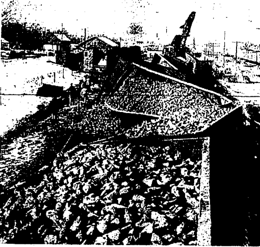
A 200-ton Union Pacific wrecker, in background, begins the job of removing twisted wrecked of nine railroad cars from the mainline of the railroad at Hansen Friday morning.