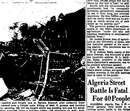
Firemen wet down burning railway coaches and freight cars at Barnes, England, after eastbound train from London carrying theatergoers crashed into a freight train killing at least 16 persons and burning for hours.