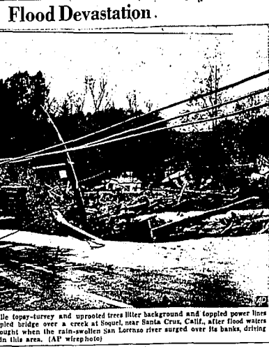
Flood Devastation. Water has inundated the area...