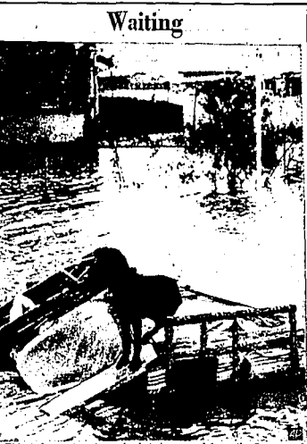
This little pooch waits anxiously to be rescued from the Coronas park area in Stockton, Calif., as flood waters receded allowing many residents to return to their homes by boat. The dog did not seem to suffer any ill effects from riding out the flood in this spot.

WASHINGTON, Dec. 29 (AP)—The agriculture department has reported that cigarette consumption in this country increased from 1954 to 1955 and predicted it would continue to make gradual gains next year. But the output of cigarettes is likely to fall considerably short of the record production in 1955, the agency said. This year's output was reported at 416 billion, compared with nearly 402 billion in 1954, 42 billion in 1953 and 433 billion in 1952. The department said a factor favorable for increased consumption is the prospect that employment and income will continue at high levels. On the unfavorable side is the fact that retail prices in some areas have increased, or soon will, because of advances in state taxes on cigarettes. The department said the consumption of king size, filter tip, cigarettes made substantial gains this year. Unofficial trade reports were said to indicate that filter tip cigarettes amounted to at least one-fifth of the total output by late 1955. The output of tobacco for pipes and roll-your-own cigarettes on the other hand, declined slightly this year. Likewise, the production of chewing tobacco continued a long downturn, the decline being 23 per cent this year. Production of snuff increased slightly.