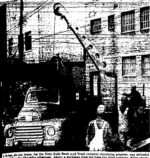
A 17-foot, six-ton beam for the Twin Falls Bank and Trust company remodeling program, was unloaded at the building Thursday afternoon. About a year later from the City Steel company, Boise, the beam will support the roof when the east side of the building is removed to create one large room.