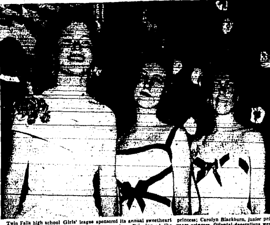
Two Fall high school girls' leagues sponsored its annual sweetheart ball Saturday night in the high school gymnasium.