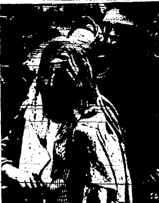
This dead Turkish woman is one of 11 persons injured in a riot between Greeks and Turkish Cypriots in the village of Vassilia. This was the first Greek attack between the two island communities.