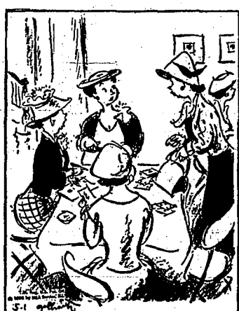
"Oh, I remember now - you were telling about your gall bladder operation and we went down four no-trump!"