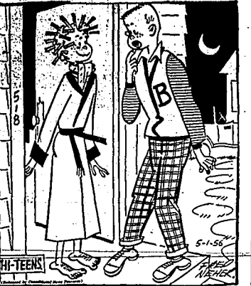
"Dreamboat! Is that YOU?"