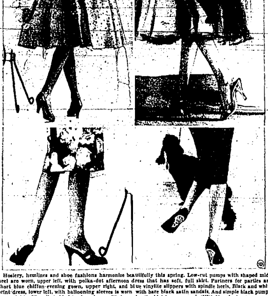
Hosiery, hemlines and shoe fashions harmonize beautifully this spring. Low-cut pumps with shaped mid-heel are worn, upper left, with polka-dot afternoon dress that has soft, full skirt. Partners for parties are short blue chiffon evening gowns, upper right, and blue vest-like slip with spaghetti heels. Black and white print dress, lower left, with ballooning sleeves is worn with bare black satin sandals. And simple black pumps, lower right with nail-studded heels pair up with lean a heart skirt in gray wool. (NRA Neufwater)