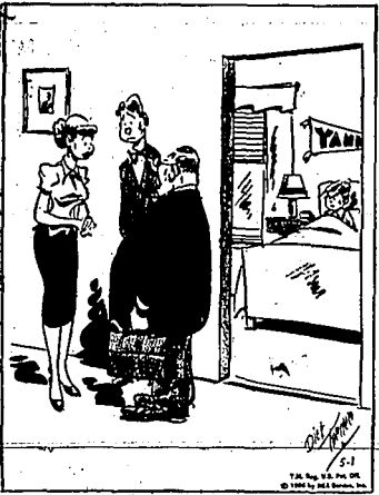
"It has a scientific name, of course, but in plain English we call it 'dodging a history exam!'"