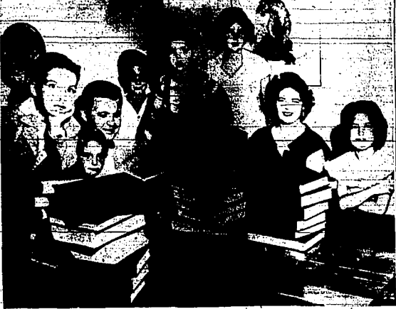
Seven's His Number. A young boy, seven years old, is the center of attention in this group photo. He is surrounded by family and friends.