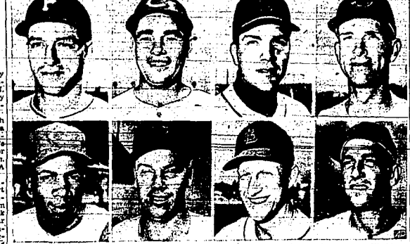
Here are eight starting players for the National League in the 23rd All-Star baseball game at Washington, July 10. Selections were announced after final fan vote was tabulated Thursday.