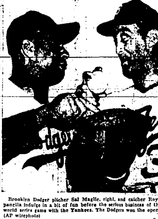
Brooklyn Dodger pitcher Sal Maglie, right, and catcher Roy Campanella, left, in a bit of fun before the serious business of the first post-rain game with the Yankees.