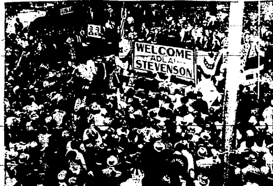
Adlai E. Stevenson (above welcome sign) speaks to an estimated 5,000 early-morning risers at Seranton during his sweep across Pennsylvania by train on his much-advertised "walk-stop" tour, the first in the 1956 campaign. Strongly opposing the President's charges that the Democrats are trying to "foot" the people, Stevenson arranged a special TV broadcast on the CBS network to give the nation his answers.