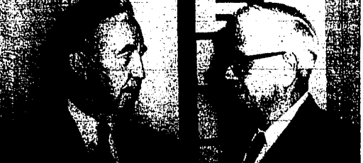
Republican Sens. Andrew F. Schoepel, Kans., left, and Henry Dworshak, right, discuss GOP chances in Twin Falls today following a rally at the American Legion hall Thursday night. Senator Schoepel had invited Sen. Herman Welker to visit in congress.