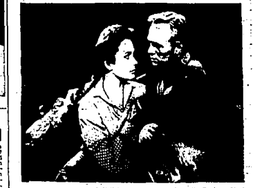
Richard Widmark and Felicia Farr appear in 20th Century Fox's newest outdoor-action release in CinemaScope. This fine program has been brought to the Grand-Vu especially for this closing program of the season.