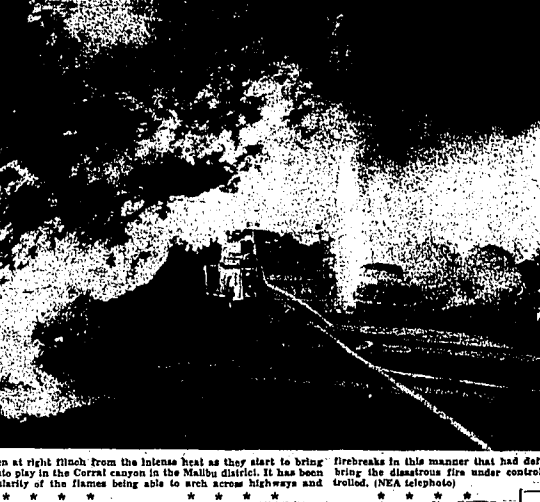
Flames at right flight from the intense heat as they start to bring a hose into play in the Cornell canyon in the Malibu district. It is this peculiarity of the flames being able to arch across highways and