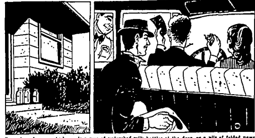
Sure sign of an empty house is a row of unlocked milk bottles at the door or a pile of folded newspapers. An uncut lawn or drawn shades also advertise that "they've gone away." So attend to these things before you drive off. There on the road, you're not relieved of being careful. A hitchhiker may be just after a ride. He may be after something else. Don't pick one up. And don't flash that roll of money in front of strangers. It may be an unintended invitation to a crack on the noggin—nothing worse.

When you lock the doors and make sure you do and take off on that long-awaited vacation, carry these items in your mental luggage, J. Edgar Hoover, director of the federal bureau of investigation, offers the tips below to those who had to make it "a perfect vacation." Carelessness can mar the finest time, if you let it. The careful vacationer will bring back happy memories. The careless one may not wish to recall the time we went to . . .