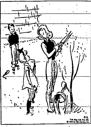
"Marvin asked me to go steady, Mom, but I don't know—he only gets a dime a week spending money!"