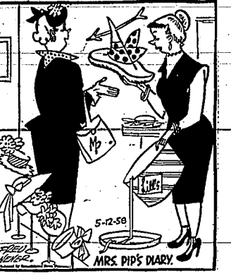
"It wasn't my husband that talked me out of it... it was my psychiatrist."