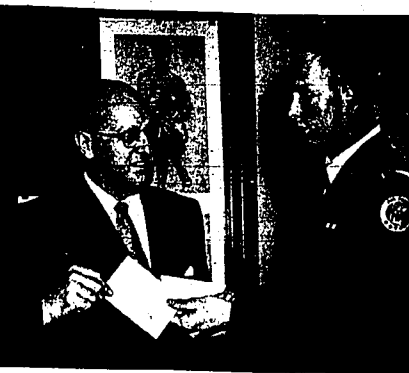
Special Invitations to attend the military ball May 16 given by the three ROTC units at the University of Idaho, Twin Falls, representing the Army, Navy, and Air Force ROTCs.