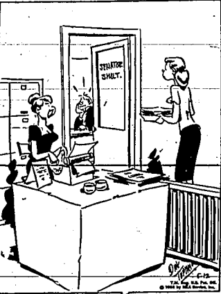
"He's worrying about space problems—the possibility that the next election may create some around here!"