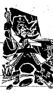
"Horse Shu Hairy"