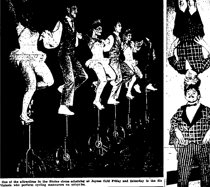
One of the attractions in the Shrine circus scheduled at Jaycox field Friday and Saturday is the Six Prietans who perform cycling maneuvers on skis.