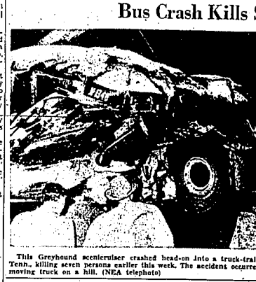
This Greyhound sculler crashed head-on into a truck-trailer and burst into flames near Pulaak, Idaho, killing seven persons earlier this week.