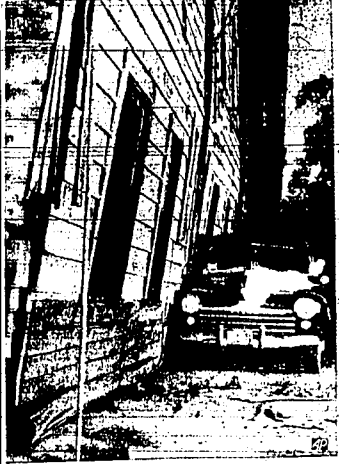
The walls of an old frame hotel on the fringe of the downtown section of Los Angeles seem to be held up by a parked car as the five-story building began to sag. Two hundred residents have been evacuated. Officials said the structure apparently has begun to slide from its foundation. Three people were hurt when parts of the interior collapsed. Officials believe the whole building will collapse. (AP wirephoto)