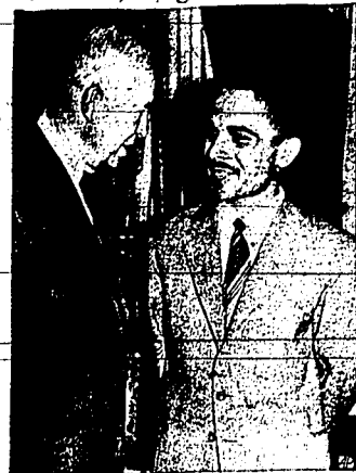
President Eisenhower talks with King Hussein of Jordan in his White House office in Washington. The youthful monarch is on an unofficial visit to the U. S.