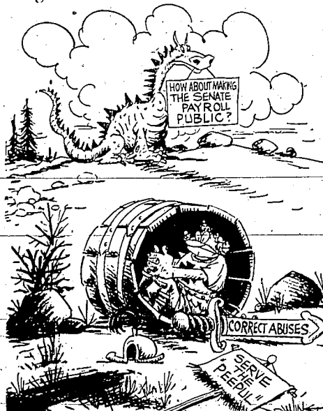
Dragon's Now Hunting for Saint George