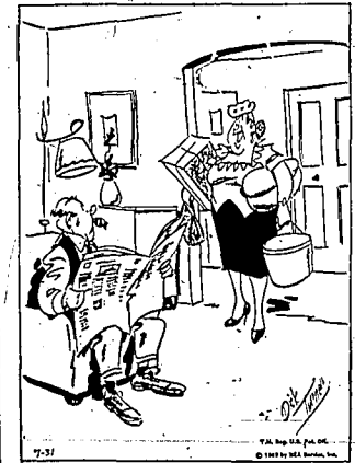
"I found some real bargains today—a dress, hose, hat and a cheaper parking lot!"