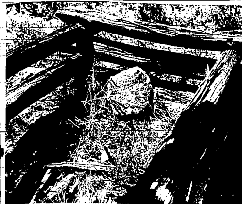
This picture taken last summer shows the grave of an Idaho pioneer in the Sawtooth City cemetery, Stanley Idaho county, as it looked before vandals entered it about three weeks ago. The intruders tore the white logs shown in the picture and removed the large rock which marked the grave since the tombstone disappeared years ago. They proceeded to dig up the remains of the person buried there. The grave had been partially refilled, when discovered. (Staff engraving)