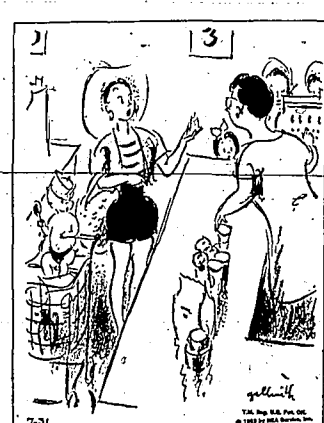
"I'll pay for this cheese Bobby grabbed off the shelf, but he seems to have eaten the price mark!"