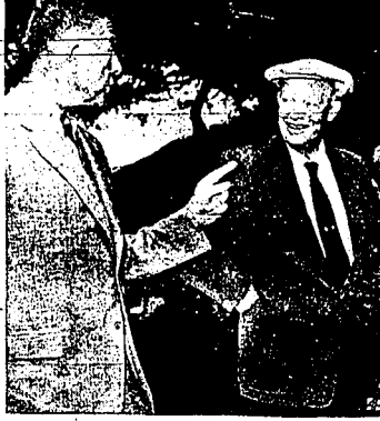
Secretary of Defense Neil McElroy gestures with his finger to make a point as he presides at a conference today at the National Golf club. The President held a top level conference yesterday with defense and budgetary advisers to discuss the nation's military spending for the current 1960 fiscal year.