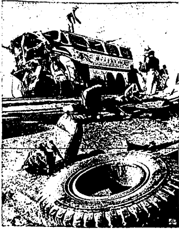
Nine died, seven in this Greyhound Scenicruiser, when it collided head-on with a double-decker cattle truck loaded with 67 calves about 12 miles east of Tuzson, Ariz., on U. S. highway 80. This daylight wreck is a grim reminder of the early morning crash.