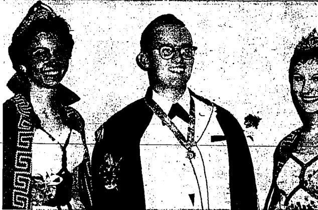
Past and present officers of the Job's Daughters and DeMolay groups in Twin Falls were honored at a ball Wednesday in the Elks ballroom...