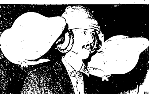
This is no fellow to have around when whispering secrets—nothing gets past his big ears. The man with the Mars-like headgear was modeling a Trench invention to amplify long signals from other ships at sea. The navigational aid was exhibited at the annual inventor's show in Brussels, Belgium.