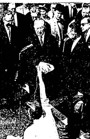
West German Chancellor Konrad Adenauer, center, shook hands with San Francisco Mayor George Christopher at international airport Monday shortly after arrival by plane from Los Angeles. The 84-year-old German statesman arrived to address Charter day ceremonies of the University of California, Berkeley. Others are unidentified.