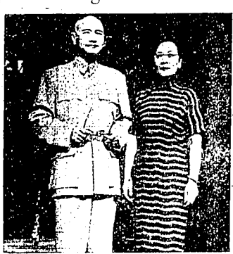
President Chiang Kai-shek won an expected landslide victory for reelection in the national assembly in Taipei, Taiwan. He is shown with his wife in the garden of their home just outside Taipei, (USA) telephoto.