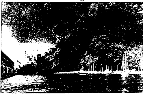
The Los Angeles harbor area, is drenched by smoke after fire broke out and spread to an 800-foot dock under construction. The huge blaze endangered the Mason line terminal and warehouse buildings. A small boat docking area is in right foreground, across the channel from the blaze. Mason piers are at left. The damage was estimated at 2 1/2 million dollars.