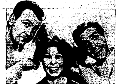
"PEACH AND A PAIR" 3 talented night club entertainers who have appeared in many TV shows, including Steve Allen and Gary Moore Shows.

"Chic" Johnson and "Ole" Olsen are known the world over for their zany comedy and hilarious antics. Their many Broadway shows include: "Hellzapoppin'," "Son 'O Fun," and "Pardon Our French." Olsen and Johnson have also starred in several movies, including their production of "Hellzapoppin'" and "Crazy House."