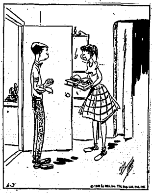
"Oh, Jimmy, you shouldn't have! Not with my birthday today, too!"