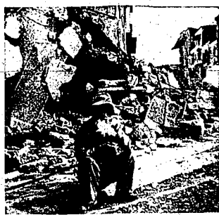
Life goes on for a million of Chile, Chile, as its on sidewalk of this town on Chile's Chile Island. The town itself looks as if it had been the target of a nuclear bomb. Eighty per cent of the buildings were destroyed in recent earthquakes, and some 10,000 persons are homeless.