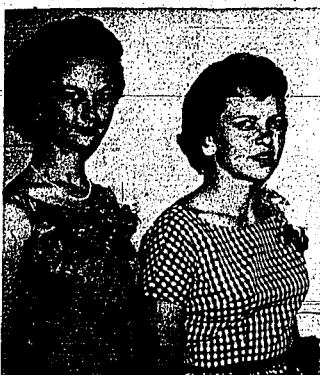
New officers were installed Wednesday evening during a meeting of Alpha Nu chapter, Epsilon Sigma Alpha society...