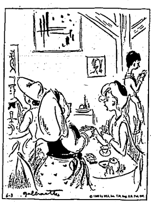
"When will the cost of living reach its peak? That's when I'm engaged to be married after!"