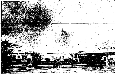
This was the scene as firemen battled a fire at the Hotel El Rancho, Las Vegas, Nev., last week. Officials said the fire apparently started in a kitchen adjacent to the Opera House theater and restaurant. The plush hotel, which is one of Las Vegas' oldest, burned to the ground in less than two hours.