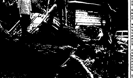
A large tree was uprooted by a windstorm in Jerome, Idaho, Tuesday.