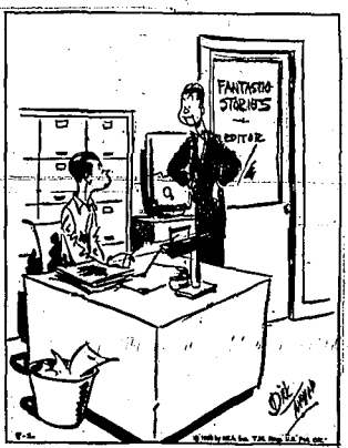
"He didn't give me the raise, but he bought the story about why I had to have it!"