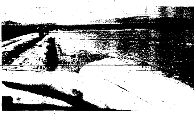
A flash flood near Strevell Sunday afternoon washed silt and debris across highway 30 forcing cars to swim in a snail pace for flood washers. The flood from a cloudburst damaged roads and the shoulders and filled borrow pits with water. This photo was taken approximately 10 miles south of Malta. Water filled miles of borrow pits. (Staff photo-exposing)