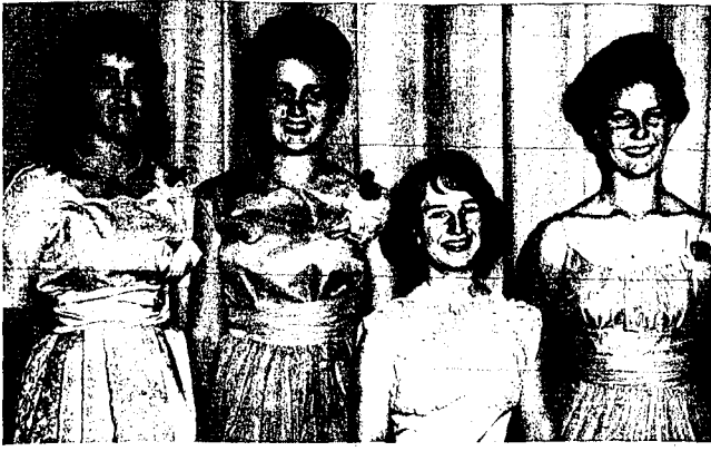
Officers of Twin Falls high school and junior high school Future Homemakers of America chapters were installed Monday evening at the junior high school auditorium.