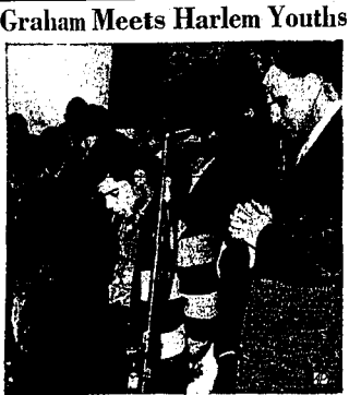
Evangelist Billy Graham is shown during a moment of prayer with a group of teen-agers that included members of various youth groups in New York's east Harlem area. There were varied reactions to his visit, some showing real interest while others were indifferent.

He said that he had known Nixon since he was a young man in the White House and that he had known Nixon since he was a young man in the White House.