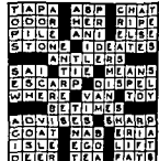
Solution of Yesterday's Puzzle