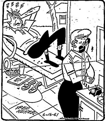
"Roscoe has car sickness... the payment is due again!"