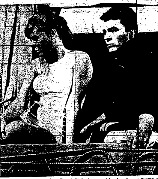
James Darren looks at the unhappy Deborah Walley in a scene taken from the new Columbia romantic comedy, 'Gidget Goes Hawaiian'.