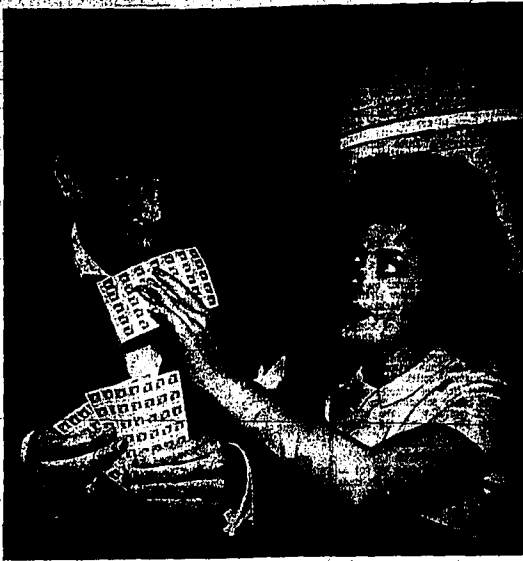
Red Skelton's tongue gets workout with trading stamps, but guest star Cara Williams' voice gets a rest when George Appleby (Skelton) invents a wife slicer in "Applesauce Remote Control" in "The Red Skelton Show" June 27 on the CBS television network.