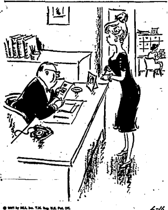
"Miss Perkins, you've been brightening up my letters again!"