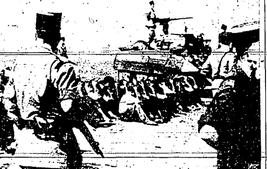
Moslem demonstrators arrested by French army all with hands to heads under armed guard at Guelizville, near Algiers.