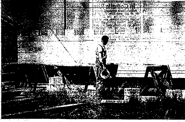
Don Loveland, secretary-manager of the Cassia county fair-board, looks over construction of a 57-foot addition to the 4 1/2 story building in the northwest portion of the fairgrounds. Work on the building began last Friday and completion is expected by July 20. The cinderblock extension is 12 feet in width and is a sheet type building that will be open on one side. It will hold approximately 25 animals. Footings also were poured for a 24-by-100-foot cinderblock barn for 20 horses.