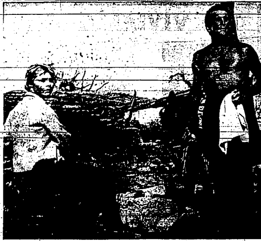
Kirk Douglas in the movie "Sling Shot" who's stampeding the movie gods of the west in "The Last Sunset" action picture of "Sling Shot" and passion in "The Gun Fight" and "The Last Sunset" with Douglas and Rock Hudson in "The Last Sunset".