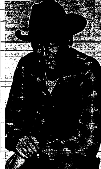
James Stewart, star of John Ford's latest color Western, "Two Rode Together," has worn the cowboy hat shown above in every Western he has played in since 1930's "Winchester '73'."