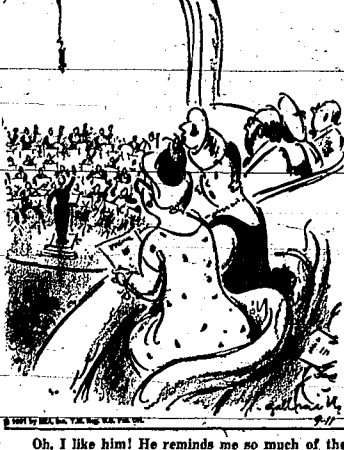
Oh, I like him! He reminds me so much of the nice policeman who directs traffic at the super-market!"