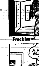
© 1941 by NEA, Inc. All Rights Reserved.

"NOW STUDENTS ON THE SUBJECT OF DINOSAURS THE BOOK SAYS THEY WERE OF THREE TYPES."