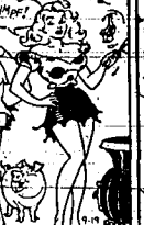
© 1941 by NEA, Inc. All Rights Reserved.

"SO DO CONSIDER SPONSORING A TV SPECIAL FOR YOU TO SHOW THE HONOR WHAT YOU'VE DONE—AND HOW!"