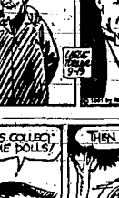
© 1941 by NEA, Inc. All Rights Reserved.

"GOOD NIGHT! I'VE COMED TO YOU SOMETIME OR OTHER, BUT COULDN'T YOU AT LEAST INTO THE HOUSE?"