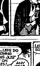
© 1941 by NEA, Inc. All Rights Reserved.

"YEAH! EVERYBODY IN THE WORLD WILL BE EQUIPPED WITH MY ROCKET. I'VE GOT A PLUS OF MONEY, MY TREASURER WILL HAVE TO BE AN ALPINE CLIMBER! YOU'VE BEEN BURNED BECAUSE NO IDEA LIKE THAT EVER RATTLED IN YOUR DICK SO, HEARD?"