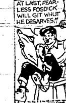
© 1941 by NEA, Inc. All Rights Reserved.

"AT LAST, FEARLESS ROSCOCK WILL GET WHAT HE DESERVES!"