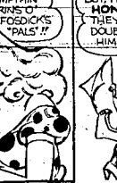
© 1941 by NEA, Inc. All Rights Reserved.

"WELL, LET'S DO SOMETHING BESIDES JUST PUT ON MILES!"