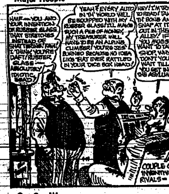
© 1941 by NEA, Inc. All Rights Reserved.

"YEAH! EVERYBODY IN THE WORLD WILL BE EQUIPPED WITH MY ROCKET. I'VE GOT A PLUS OF MONEY, MY TREASURER WILL HAVE TO BE AN ALPINE CLIMBER! YOU'VE BEEN BURNED BECAUSE NO IDEA LIKE THAT EVER RATTLED IN YOUR DICK SO, HEARD?"