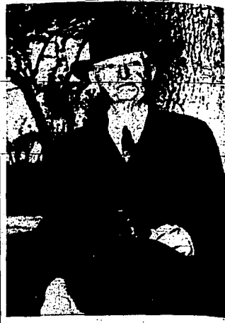
Former Vice President John Nance Garner relaxes beneath an oak tree at his home in Uvalde, Tex., where he celebrates his 93rd birthday anniversary Wednesday. Garner was vice president during the first two terms of President Franklin D. Roosevelt.