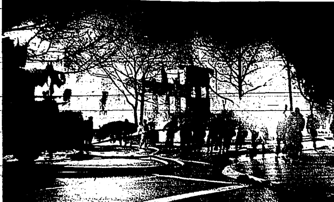
The flames claimed the lives of two firemen and leveled the three-story building Tuesday night.