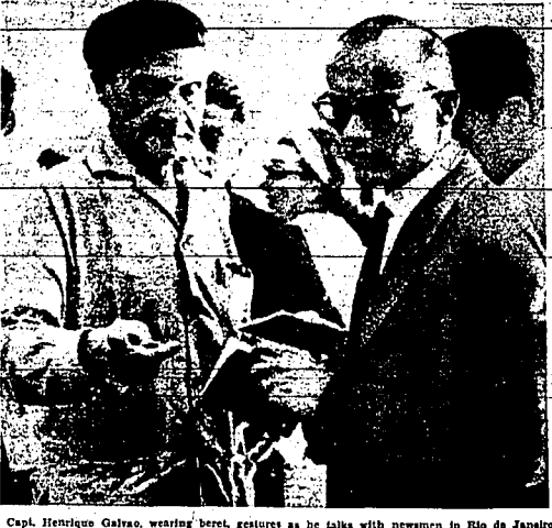
Capt. Henrique Galvao, wearing beret, gestures as he talks with newsmen in Rio de Janeiro Tuesday as he sought to have Brazil grant him refuge. Galvao has been involved in the seizure of a Portuguese ocean liner and an airplane in attempts to stir revolt against the Portuguese government. Galvao and his party arrived in Rio de Janeiro aboard a French liner from Dakar, Senegal.