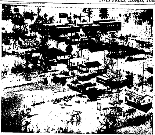
HIGH FLOOD WATERS from the Pearl River rose into Hankin county, Mississippian, homes Monday and Tuesday. The flooding here has driven some 250 people from their homes in the Jackson area...