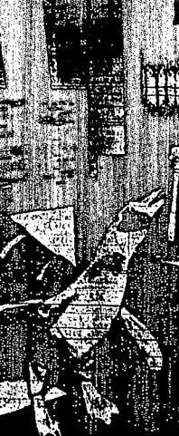
WASHINGTON, Jan. 3 (AP)—The house leadership struggle appeared about settled today in favor of a team that promised President Kennedy "most" of what he wants from congress this year.