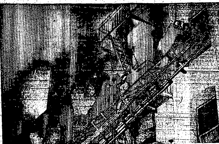
FIREMEN RESCUE two occupants from the upper floor of the Fair-Helton in San Francisco early Wednesday, as flames belched from windows of the structure. Several persons were believed trapped. It was not known if there were any deaths.