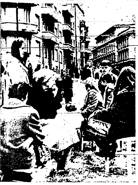
YEAR AFTER EARTHQUAKE keeps residents of Sarajevo, Yugoslavia outdoors, afraid to re-enter apartment houses damaged in Monday quake. More than 100 buildings were damaged in Sarajevo, southwest of Belgrade. Seven were injured.

BATTLE, Wash., June 12 (AP)—The government is expected to press up a tax case against Dave Beck, former labor union president, evading $400,000 in personal income tax. Beck may go to prison for a year in the tax case. Beck may go to prison for a year in the tax case.