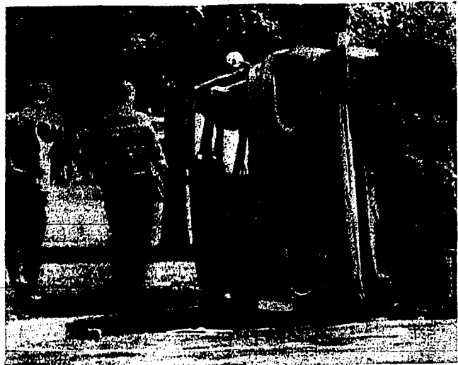
OLE MISS FRESHMEN, wearing red caps and carrying books, pass an overturned radio station bus en route to classes at Oxford. The bus, a mobile unit, was overturned during student