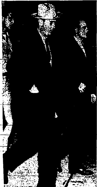
MAJ. GEN. EDWIN WALKER, middle, is shown at municipal airport in Springfield, Miss., Monday night after his arrival for confinement at the U. S. medical center here. Accompanying Walker are federal officers.