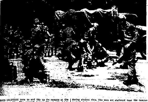
ARMED SOLDIERS turn to and tidy up the campus at Oxford, Miss. The grounds became littered with debris during student riots. The men are stationed near the campus as part of the protection force.

OXFORD, Miss., Oct. 2 (AP)—James H. Meredith, sitting on a cot in front of his bare dormitory room, said Tuesday he considers his enrollment in the University of Mississippi to be "more for America than it is for me."