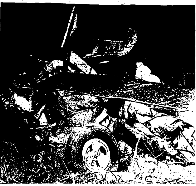
SEVEN PERSONS WERE KILLED Monday night in this wreck of a Center Airlines DeLavaland Dove airliner near Santa Barbara, Calif. The dead were misale experts of the Martin company