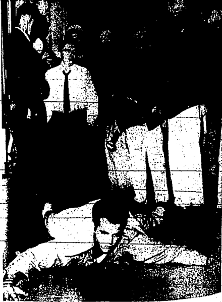
SPRAWLED ON FLOOR is a young man found lurking on the Ole Miss campus after he was taken into custody. He wore a jacket and white hood and a gas mask under the hood. Authorities declined to release his name but held him for questioning. Gas mask is on the floor at right.