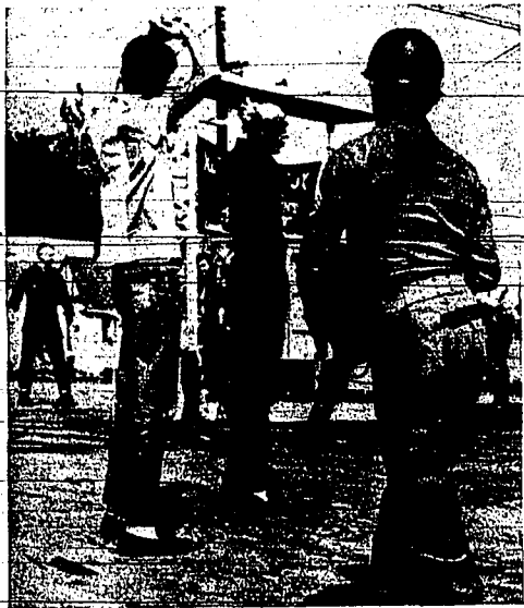
TROOPS CRACK DOWN on rioting youths in Oxford, Miss. They are shown as they arrested two teenagers in downtown Oxford. Their arrests came after army trucks and civilian cars were pelted with bricks and bottles.