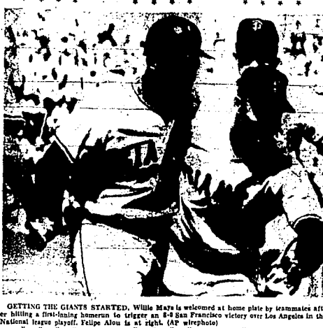
GETTING THE GIANTS STARTED. Willie Mays is welcomed at home plate by teammates after hitting a first-inning homer to trigger an 8-0 San Francisco victory over Los Angeles in the National League playoff.