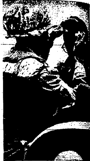
SOLDIER ASSIGNED to the troubled University of Mississippi campus gets first aid for slight wound on his head where he was struck by flying object.