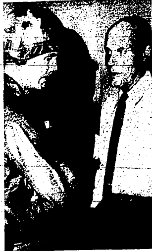
HIGH LEVEL CHAT takes place in Oxford, Miss., between Lt. Gen. Hamilton H. Howze, left, and Nicholas Katzenbach, deputy U. S. attorney general. Integration problems were the topics. The conference was held after student riots and other demonstrations.