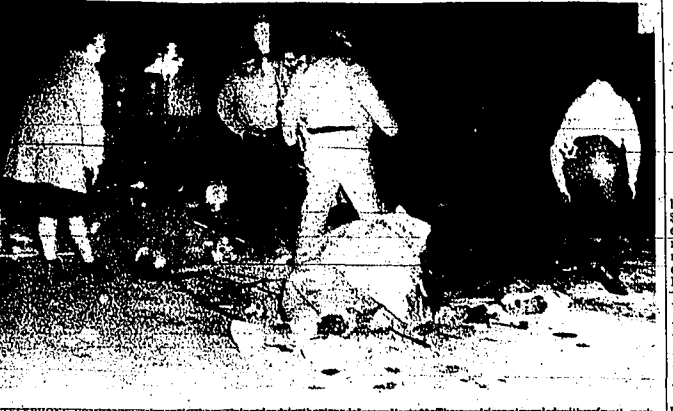
and man slung; the car driver struggled with a fourth woman and then fled on foot. The four were cutting a hole in the pavement to lay a telephone conduit when the car hit the barricade. Police said the car was registered in one man's name, the license plate in another, (AP Wirephoto)

Washington, Jan. 25 (UPI)—President John F. Kennedy was irritated today by the accusation made by Charles de Gaulle that the United States was not living up to its pledge to support Europe with new weapons.