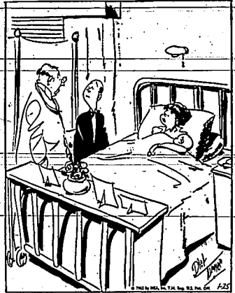
"Love him, enjoy him, cherish him! You've got 12 years before he turns into a teen-ager!"