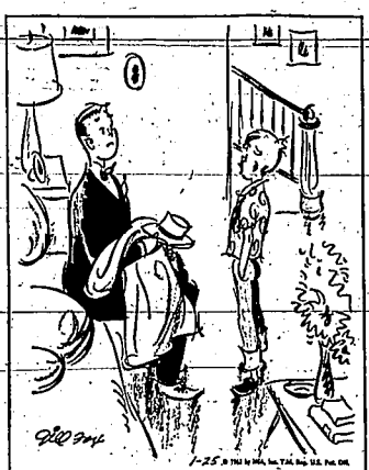
"After my sister gets married to you, Mam'll give you the dicens for tracking dirt on her rug!"