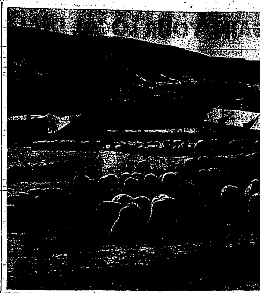
SUPPER TIME FOR SHEEP wintering at the Cavanaugh Land and Livestock company finds them lined up and paying little attention to the Times-News photographer. The scene is typical of wintering operations throughout this area.

University Sets Dairy Study Dates UNIVERSITY OF IDAHO. The University of Idaho is holding a series of dairy study dates for 1963. The dates and locations for each day are as follows: Jan. 20, Twin Falls, Jan. 21, Boise, Jan. 22, Pocatello, Jan. 23, Idaho Falls, Jan. 24, Teton, Jan. 25, Blackfoot, Jan. 26, Arden, Jan. 27, Burley, Jan. 28, Caldwell, Jan. 29, Coeur d'Alene, Jan. 30, Lewiston, Jan. 31, Reardan, Feb. 1, Boise, Feb. 2, Pocatello, Feb. 3, Idaho Falls, Feb. 4, Teton, Feb. 5, Blackfoot, Feb. 6, Arden, Feb. 7, Burley, Feb. 8, Caldwell, Feb. 9, Coeur d'Alene, Feb. 10, Lewiston, Feb. 11, Reardan.