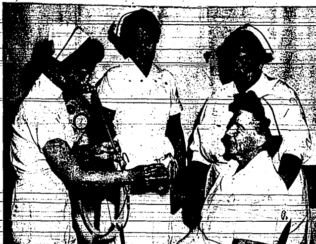
OXYGEN EQUIPMENT, which will be used during a refresher course inaugurated by Nurses Memorial Hospital, is shown being demonstrated by four of the