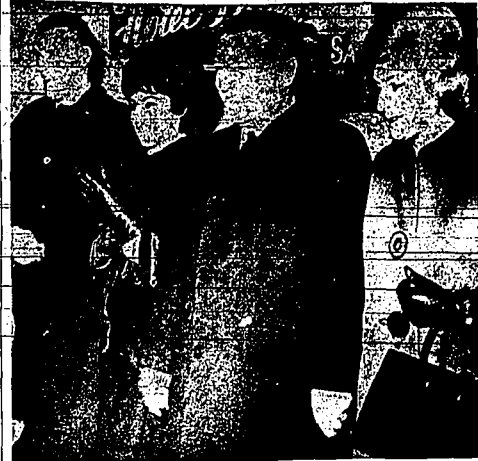
TRANSFER PRESIDENT James R. Hoffa, with a wide smile and his family by his side, was en route this morning to the federal courthouse at Chattanooga, where he went on trial on charges of jury tampering...