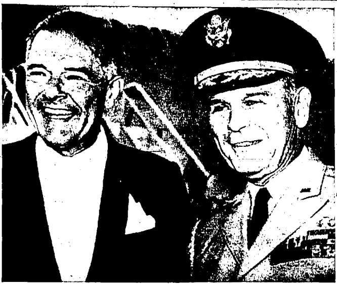
HENRY CABOT LODGE, left, poses with Gen. Maxwell D. Taylor, chairman of the Joint chiefs of staff, at Andrews air force base near Washington as Lodge returned from Viet Nam where he served as ambassador. General Taylor will replace Lodge in the ambassador post. Lodge resigned and returned to the U. S. to help Governor Scranton in his drive for the Republican presidential nomination.

One hundred sailors from the navy's airfield at Meridian rejoined the highway patrol and FBI to search west of this town for 5,000 or other officers dragged small lakes and streams.