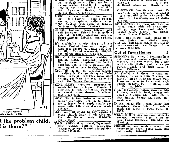
"They keep talking about the problem child. What other kind is there?"

FOR SALE 3-BEDROOM BRICK Garage, fireplace, carpet and Garage, fireplace, carpet and Garage, fireplace, carpet and