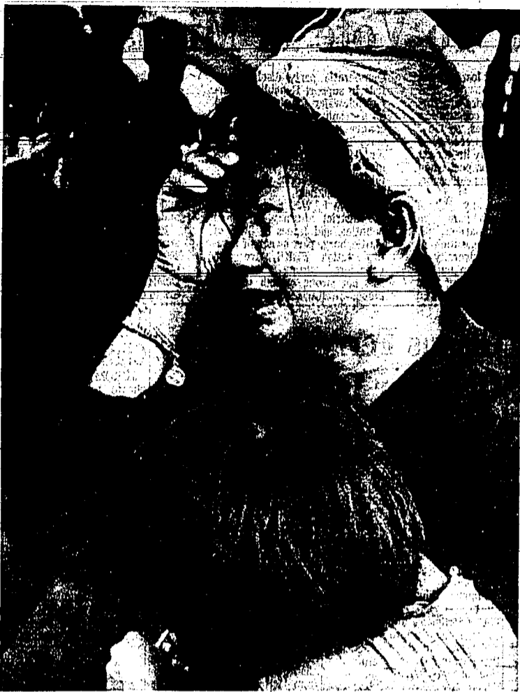
WEeping as she holds her daughter in a refugee staging area is a South Vietnamese woman who was evacuated from her home in the Kyo Valley near Tuy Hoa, South Vietnam. South Korean troops, on Operation Hong Oil Dong, evacuated the villagers to a camp at Song Cau.