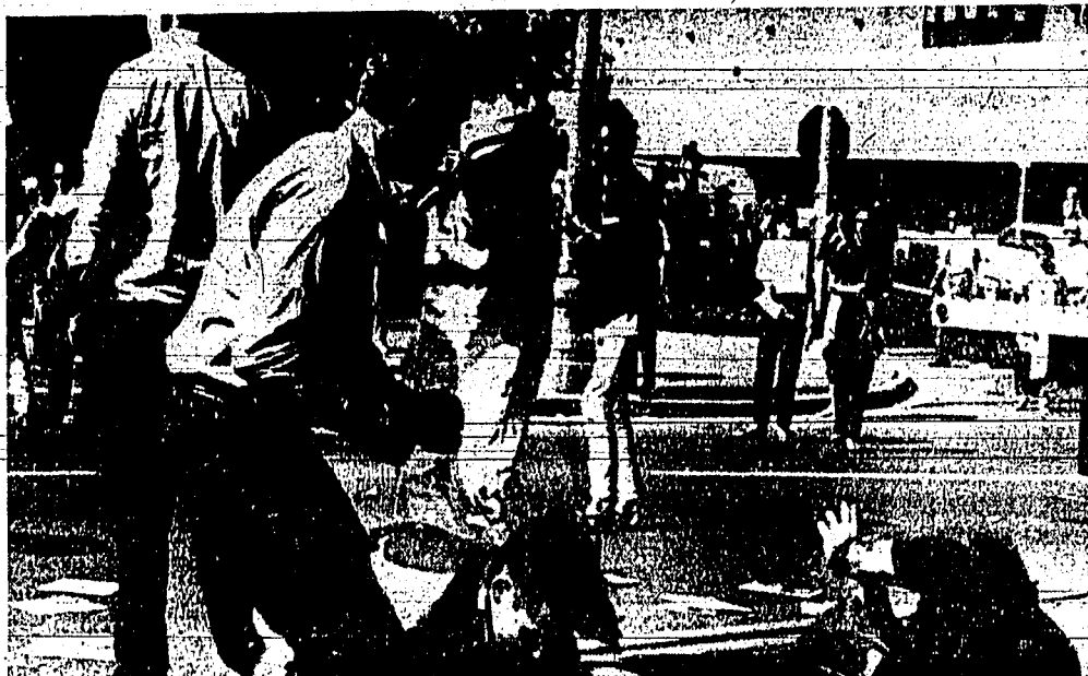
TWO YOUNG MEN wearing khaki shirts and Nazi arm bands, left, fight with an unidentified member of a parade wearing youths caused the trouble about an hour after the parade had moved peacefully.

The bride told newsmen: "The custom-dates back to the time when girls were handed over to be dominated by the man."