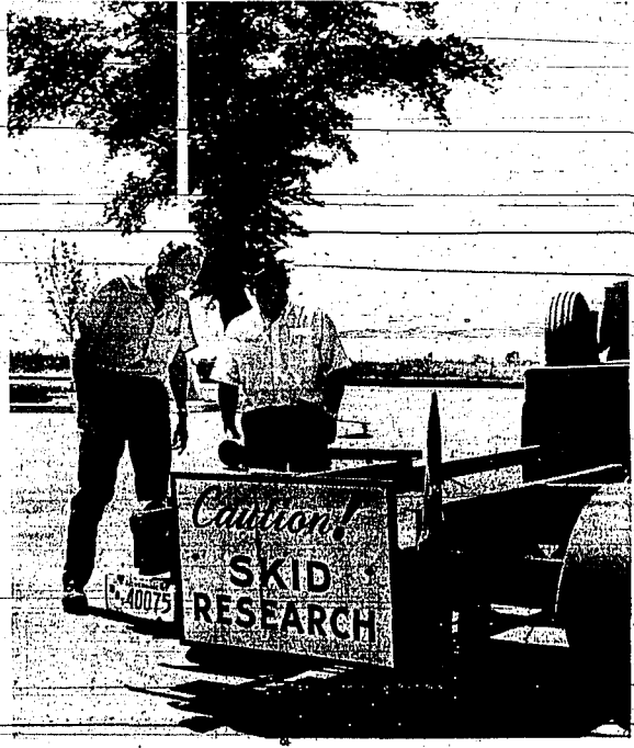
EARLIER THIS YEAR there were several accidents on Interstate 80N when cars or trucks slid on slick pavement...

The council then ordered the city attorney to draw up a new ordinance. The new one will allow parking on the street between 8 a.m. and 1 p.m. on Sundays only.