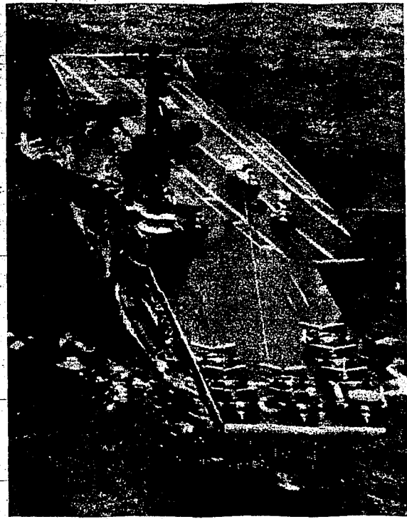
THE U.S. AIRCRAFT CARRIER Hornet sails through the South China Sea Sunday as it heads for the Sea of Japan. The Hornet was accompanied by six destroyers and is apparently the vanguard of a naval task force assigned to protect U.S. reconnaissance ships and planes.

example, he said that while a student who earns $1,700 of taxable income during the year now pays $117 in federal income taxes, he would pay none under the new plan.