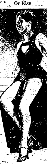
BETTY GRAHN, screen actress says she never saw a letter demanding $2,000...