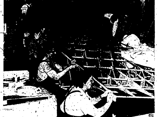
THESE FEMINE WORKERS help in sewing fabric on trailing edge of plane wings...