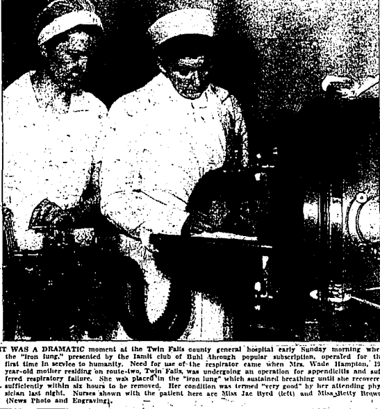
IT WAS A DRAMATIC moment at the Twin Falls county general hospital early Sunday morning when the 'iron lung' presented by the family club of Buhl through popular subscription, operated for the first time in honor of humanity.