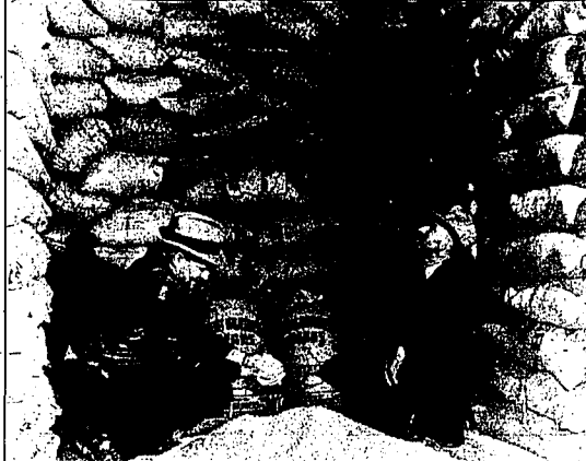
'WELL BRING THE BEANS' is the assurance of officials of the Bean Growers Warpage Association...